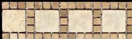
JT356T 3-1/4 x 10-1/2 Rockhampton Trav Noce/Trav Chiaro Tumbled