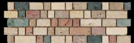
JT365 Mixed Interlock 4 x 12 Trav Chiaro/Verde/Rosso/ Botticino/Trav Noce Tumbled