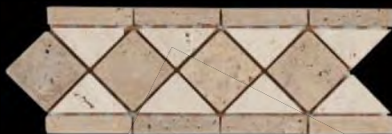
JT12 (353) 4 x 12 Trav Noce (st & sq)/Trav Chiaro (tri) Tumbled