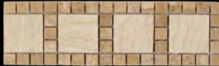
JT356P 3-1/4 x 10-1/2 Rockhampton Trav Noce/Trav Chiaro Polished