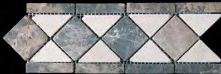
JT12 (366) 4 x 12 Emperador (st & sq)/Botticino (tri) Tumbled