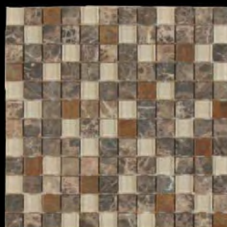
R008T 1 x 1 Emperador Dark/Linen Glass/Antique Copper Blend Tumbled