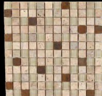
R022T 1 x 1 Trav Noce/Beige Glass/Antique Copper Blend Tumbled