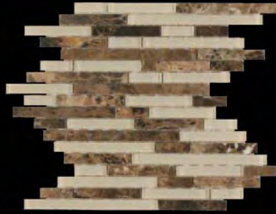
R108P Interlock 5/8 x random Emperador Dark/Linen Glass Blend Polished