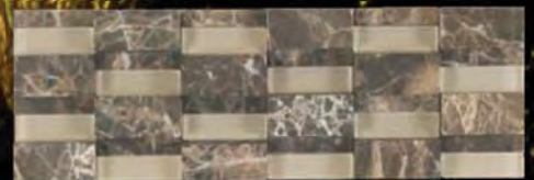
R308T High/Low Block Border 4 x 11-1/2 Emperador Dark/Linen Glass Blend Tumbled