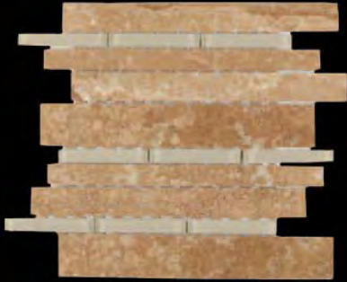
R222P Waterfall Trav Noce/Beige Glass Blend Polished