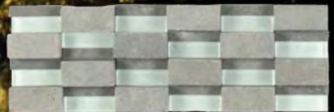
R304T High/Low Block Border 4 x 11-1/2 Bluestone/Clear Glass Blend Tumbled

The Bass Strait is a sea strait between Tasmania and Australia. It is twice as wide and twice as rough as the English Channel. Its waters have claimed many ships, resulting in a Bermuda Triangle type of legend.