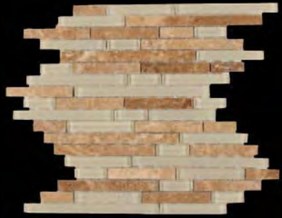
R122P Interlock 5/8 x random Trav Noce/Beige Glass Blend Polished