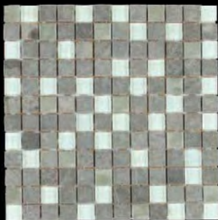
R004T 1 x 1 Bluestone/Clear Glass/Brushed Stainless Steel Blend Tumbled